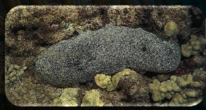
The black sea cucumber ( Holothuria atra ) is now protected under the sea cucumber rule.