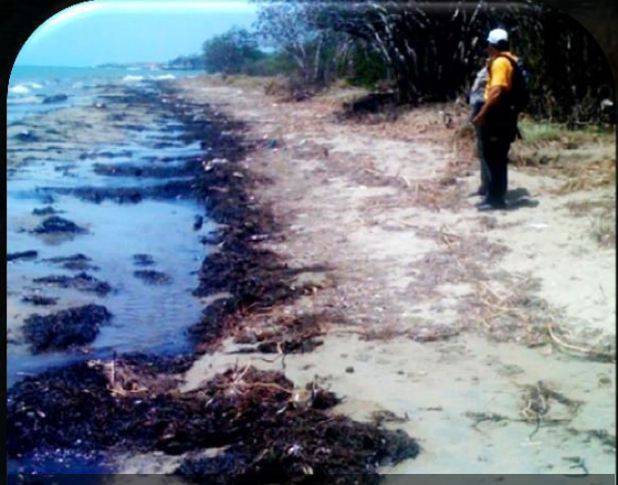
Oil spill in Guanica.